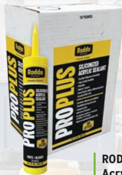
RODDA Siliconized Acrylic Sealant