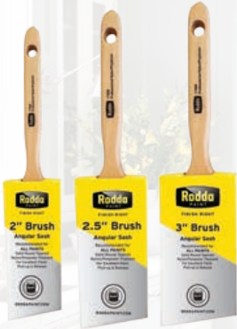
RODDA Angular Sash Brushes

YOUR SOURCE FOR ALL OF YOUR SUNDRY NEEDS!