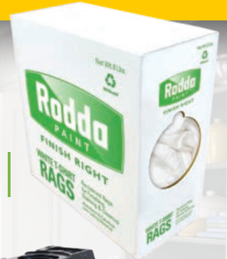
RODDA Paint Rags