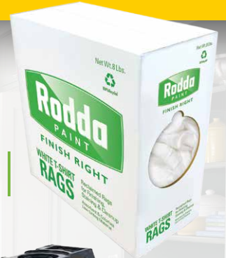
RODDA Paint Rags