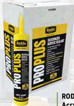
RODDA Siliconized Acrylic Sealant