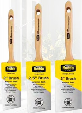
RODDA Angular Sash Brushes

YOUR SOURCE FOR ALL OF YOUR SUNDRY NEEDS!